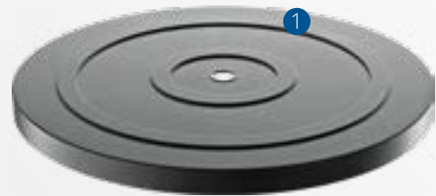
1 PS lid

PS top lid for different kinds of insulating solutions. The dimensions vary based on the water tank, insulation and client needs. Material thickness is 1,5 - 2 mm. And improves the visual appearance of the insulated water tank.